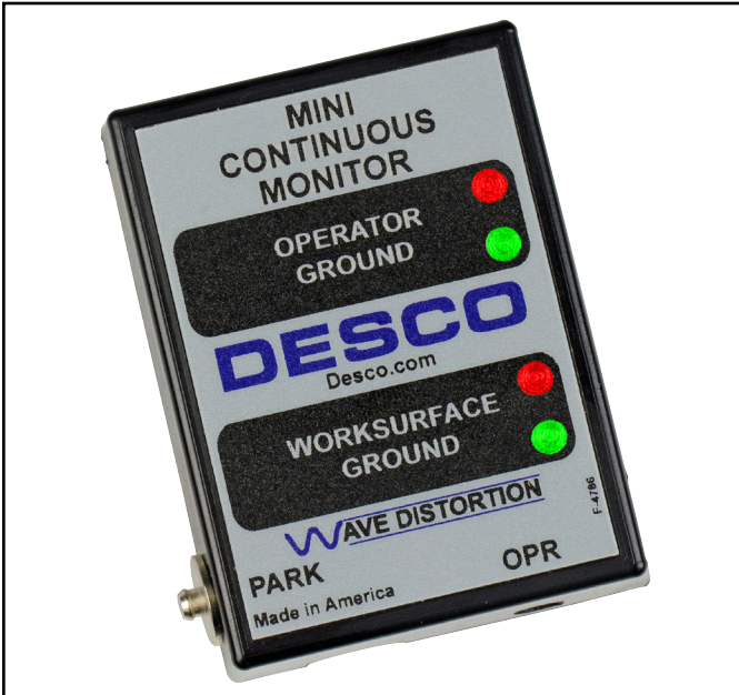
Figure 1. Desco Mini Monitor