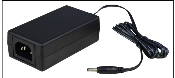
Figure 3. Universal power adapter included with the 19243 Mini Monitor

NOTE: The power cord must be purchased separately if ordering the 19243 Mini Monitor. The power cords are available as the following item numbers: