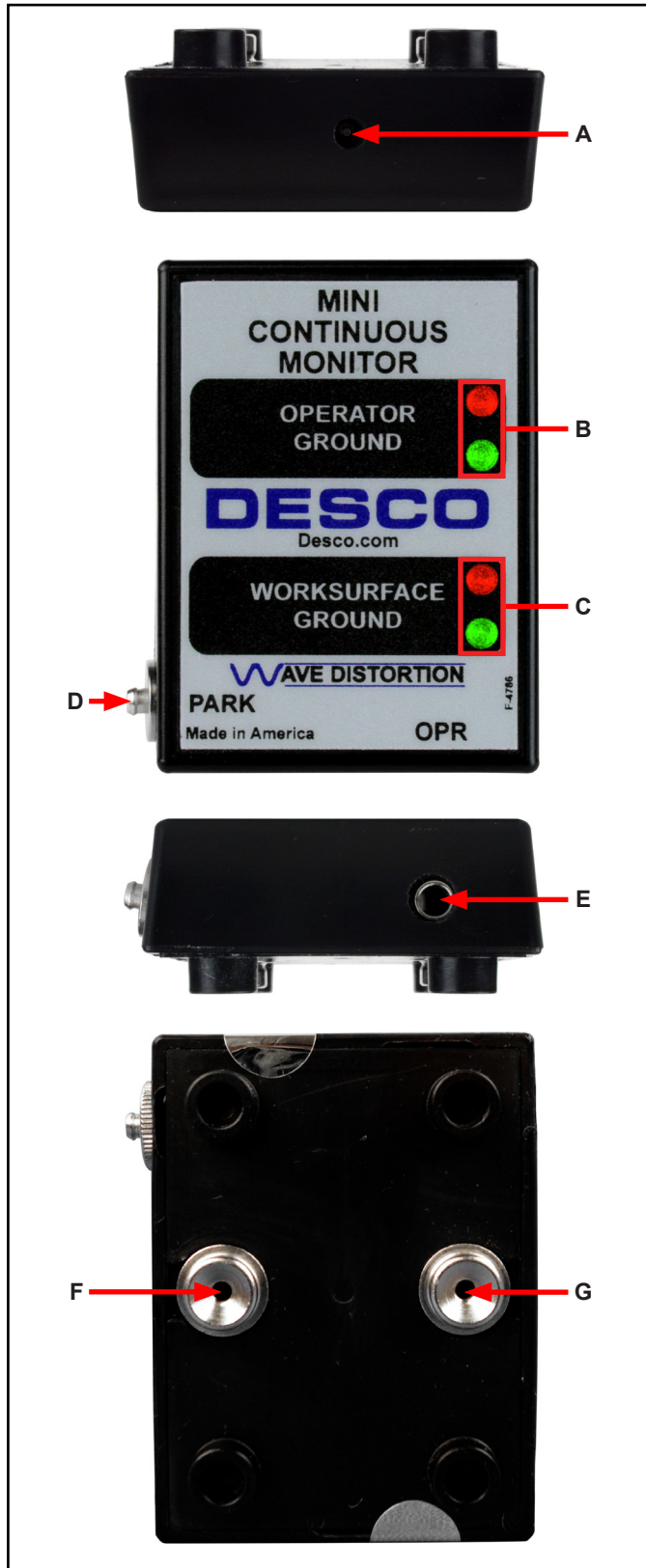
Figure 4. Mini Monitor features and components

A. Power Jack: Connect the included 24VDC power adapter here.