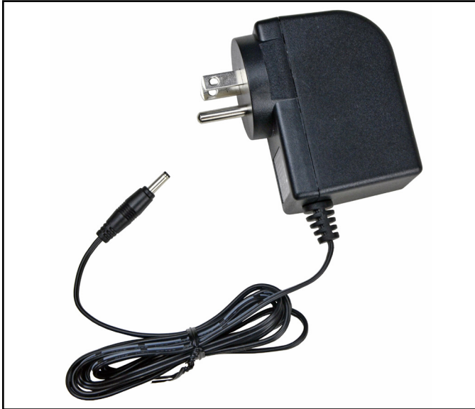
Figure 2. North American power adapter included with the 19239 and 19242 Mini Monitors